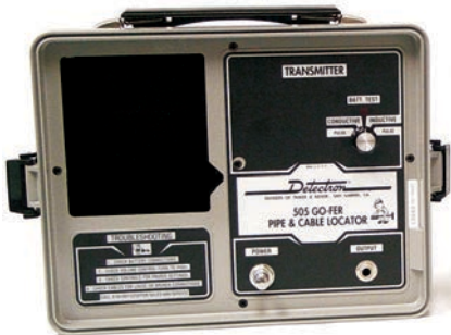
Use with Model 505 Transmitter

Isolate and ID Pipes & Cables in complex underground systems