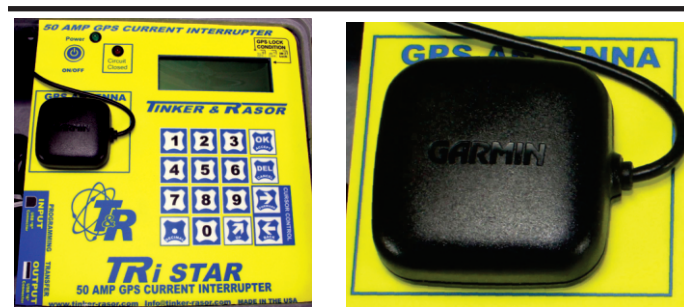
MODEL TriStar GPS Current Interrupter

DELIVERY: Immediately from STOCK F.O.B. San Bernardino, CA USA SERVICE: 24-hour Turn-Around TERMS: Net30 Days, on approval of credit WARRANTY: 90 Days , parts and labor