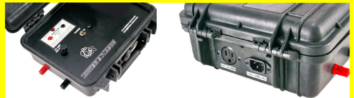
Model M1/AC shown with connection on side of case. AC connection and external alarm connection on back of instrument case. External alarm can be used for audible or visual holiday indicator.

Custom Electrodes Suitable for internal and external coatings on metal and concrete structures