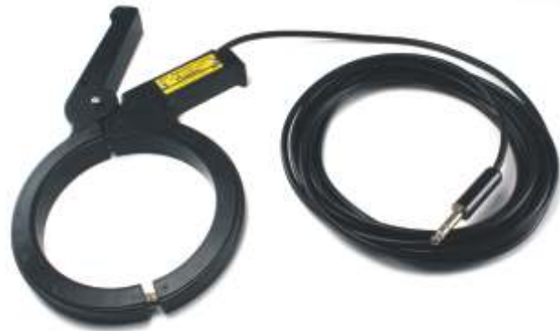
Model 505 Transmitter

Gives superior tracing and locating abilities.