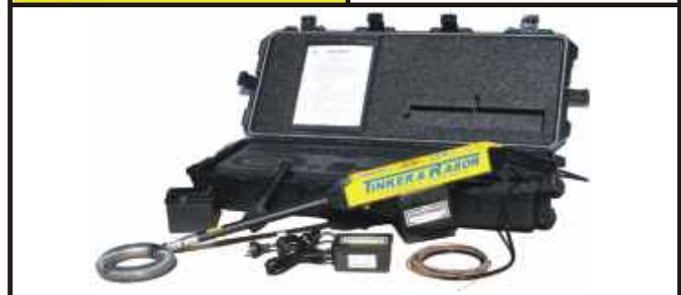
MODEL APS HOLIDAY DETECTOR

DELIVERY: Immediately from STOCK F.O.B. San Bernardino, CA USA SERVICE: 24-hour Turn-Around TERMS: Net30 Days, on approval of credit WARRANTY: 90 Days , parts and labor