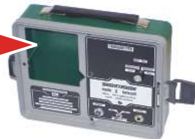
Model Mark V Ranger