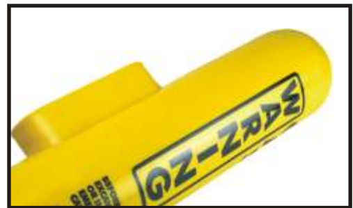
Line Marker / Test Station Combos available