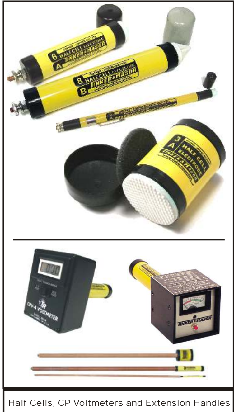
Half Cells, CP Voltmeters and Extension Handles