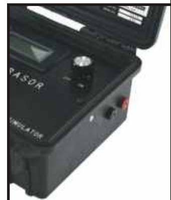
MODEL CS-1 VIEWS